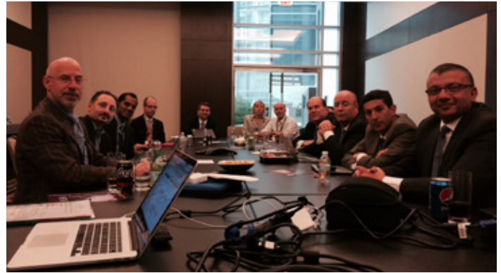
ASSFN Executive Council and Liaisons pause for a photo at AANS. (Washington, D.C., May 2015)